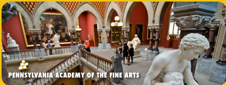
PENNSYLVANIA ACADEMY OF THE FINE ARTS