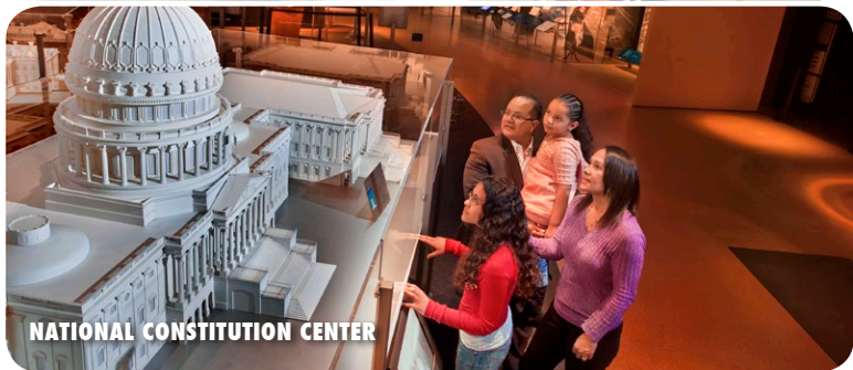
NATIONAL CONSTITUTION CENTER