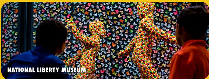
NATIONAL LIBERTY MUSEUM