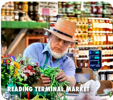
READING TERMINAL MARKET